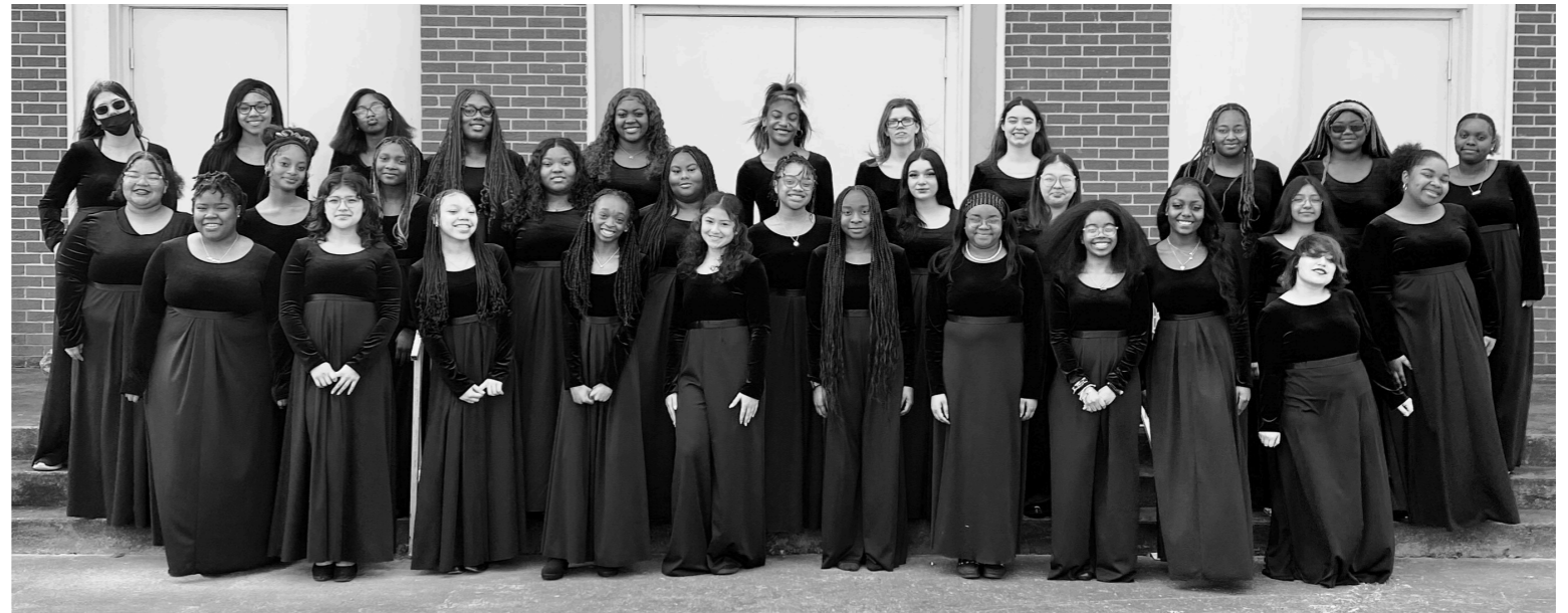
Select members of the Treble Chorale are traveling with the Ensemble members.

Horn Lake High School is one of eight high schools & one of forty-one schools in the DeSoto County School district. With over 110 years of history, Horn Lake High is one of the original high schools in DeSoto County. With just over 1,200 students in grades 9 through 12, the student population varies in diversity with approximately 70% African American, 20% Caucasian, and 10% Hispanic. In a suburb of Memphis, Tennessee, Horn Lake residents have become more transient with a large population of children & young adults. Almost 80% of the student body at Horn Lake High qualify for the Federal Free/Reduced Lunch Plan making HLHS a Title 1 campus. Although proud of the graduation rate, the faculty & staff constantly strive to increase that number. Horn Lake High is currently a B rated school. Eagle Pride! Go Eagles!